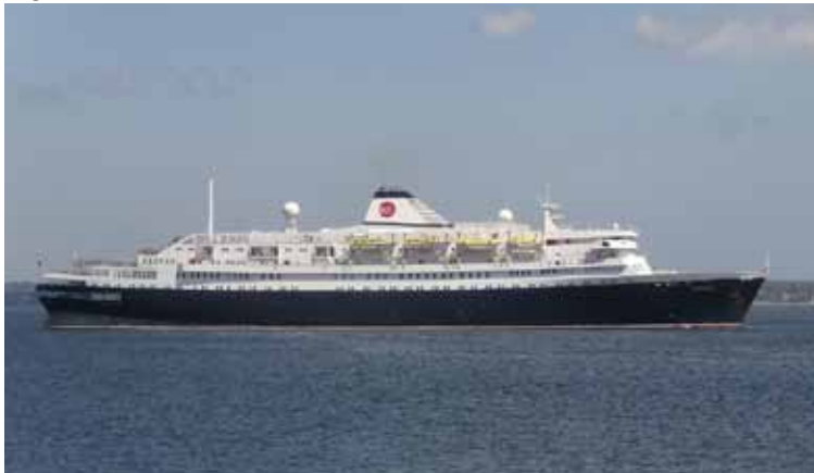
MS Astoria in June 2016

Many of you will recall the two passenger vessels, SS Andrea Doria (Italian)/MS Stockholm (Swedish) which collided in 1956 in which the former vessel sank with the loss of 46 lives, with 1,660 lives saved. The Stockholm was able to continue her voyage to New York. The Stockholm, now sailing as the ‘Astoria’ under the Portuguese flag, was recently sighted off Tallinn, Estonia.